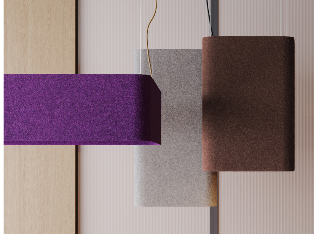
PRODUCT FAMILY: QUAD / FELT: WISTERIA, FLINT, SIENNA / CORD COLOR: BRONZE, BLACK

THIS APPROACH ALLOWS US TO DISCOVER AND INTRODUCE A NEW RANGE OF IDEAS. WE ARE STEWARDS OF TIME AND MATERIALS, SEEKING METHODS AND MEANS FOR MORE EFFICIENT PRODUCTS, WITH LESS IMPACT ON THE ENVIRONMENT.